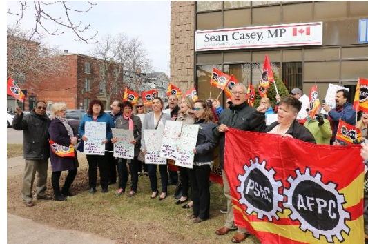
(Members of the Atlantic Regional Council, guests and observers at an impromptu rally in Charlottetown, PE)

for the greater good of the membership. For example, we denounced the fact that the Chronicle Herald newspaper was delivered to us at some facilities, walked the picket line with workers on strike and organized an impromptu rally to denounce the lack of government help to fix the Phoenix Pay System. These are some examples of initiatives that are undertaken when we meet in person.