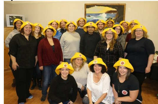
(2016 Young Workers Symposium)

Following the 2015 PSAC National Convention, the age for young workers has been changed to 35. Since our last Regional Convention, we organized a Young Workers Symposium in Port Blandford, NL, Nov. 4–6, 2016. It was a highly successful event with a multi-pronged mission: explain the structure of PSAC and how to establish young workers' committees, provide lobby training, forge new friendships and build networks between young workers in our region. The feedback received from the 18 participants was overwhelmingly positive. The St. John's Young Workers Committee played a pivotal role as the host committee. Since the retreat, members have established a committee