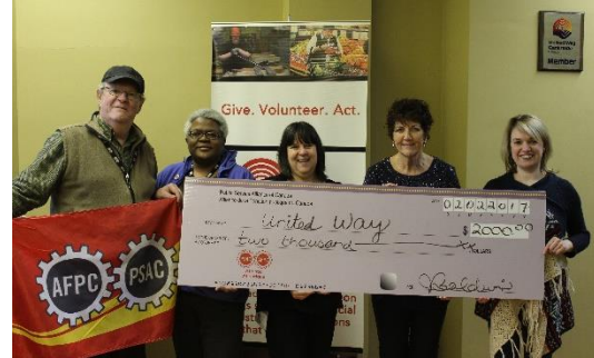
(Members of the Cape Breton Area Council and Regional Women's Committee presenting a cheque to the United Way)

The PSAC Social Justice Fund plays an important role across the country and in the Atlantic Region. We have done our share to promote the value of the fund in our region. We reported on the various anti-poverty initiatives supported in every province of the Atlantic as well as the international solidarity work done with the Tatamagouche Centre in NS through Education in Action and Breaking the Silence projects. We also accessed special funding to help local communities hit by acts of nature such as flooding in Nova Scotia and major ice storms in New Brunswick. It is important that our members see first-hand the impact of the PSAC Social Justice Fund in their local community.