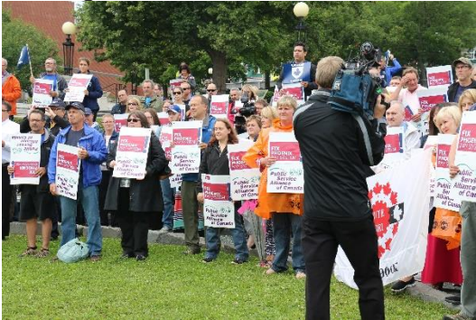
(Rally in St. John's, NL)

It goes without saying that the Phoenix pay system has been an ongoing campaign for the PSAC. In the Atlantic Region, we have provided support to various Components who took the lead on many activities. For example, a plantgate, demo and press conference organized in St. John's NL by the Union of National Defence Employees and an appreciation lunch provided to the staff at the Miramichi Pay Centres sponsored by the Union of Solicitor General Employees and lobby campaigns. The St. John's Young Workers Committee also took advantage of the snow and spray painted the words "Fix Phoenix" on the snow — this action also guaranteed us media coverage.