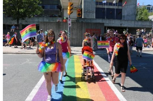
(2016 St. John’s Pride Parade)

We continue to demonstrate our pride and support at numerous pride parades in the region. Various regional committees work hand in hand in ensuring a strong PSAC presence at these events.