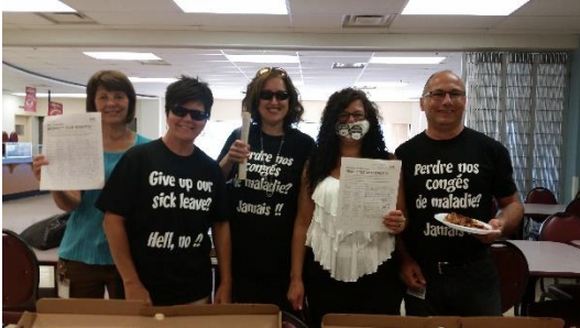
(Members of CEIU local 60269, Bathurst, NB)

Thanks to our members and the determination of the bargaining teams, we were able to protect our current sick leave provisions. Although we replaced the government, we had to keep up the pressure on the Liberal government to protect this important benefit that should be accessible to all workers. I'm extremely proud of all the mobilization activities we did to promote healthy workplaces.