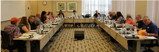
(Members of the Atlantic Regional Council)

At the 2014 Regional Convention, the membership elected a dedicated group of leader-activists to the Atlantic Council. Following their election, Directors received social media training and many have become the voice of the union in their regions. They also received safe space training which is aimed at increasing the visibility of supportive people and positive spaces for the GLBT community.